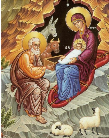
The Nativity of Christ